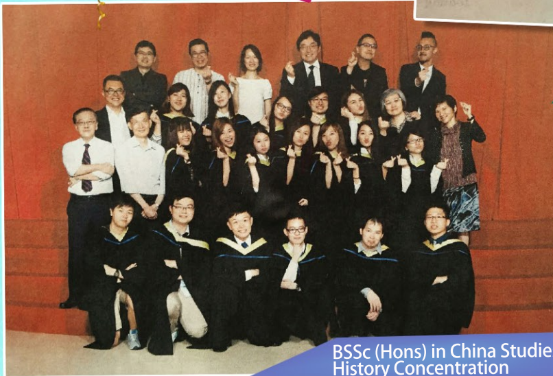
BSSc (Hons) in China Studies - History Concentration