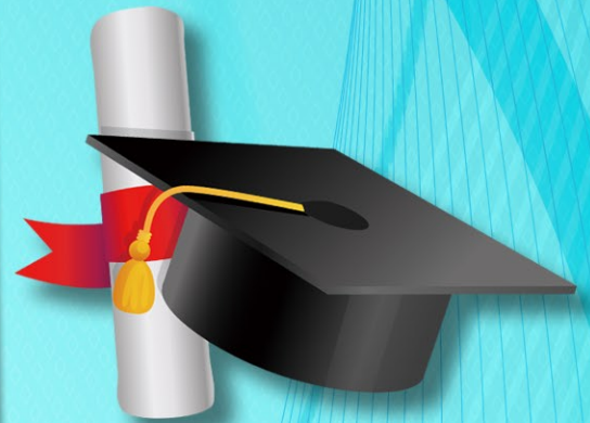
BA (Hons) in History and BEd (Hons) in Liberal Studies Teaching