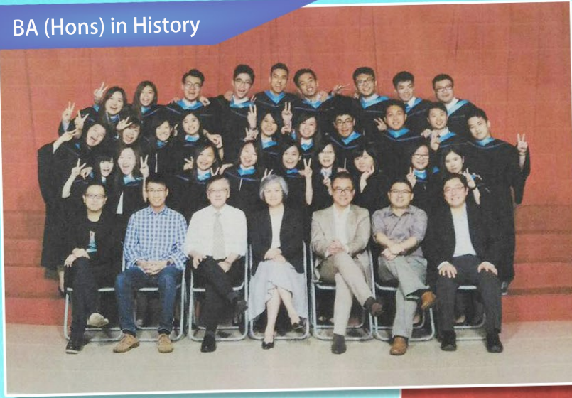
BA (Hons) in History

The Class of 2016, including BA (Hons) in History, BSSc (Hons) in China Studies – History Concentration, and BA (Hons) in History and BEd (Hons) in liberal Studies Teaching, took the graduation photos during late May and early June. Most of the members of the Department joined the photo taking sessions and shared the happiness with the Class of 2016. The Department of History sends out sincere congratulations and best wishes to the Class of 2016!